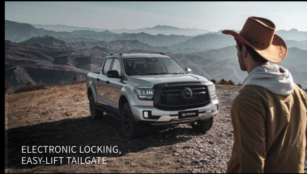
ELECTRONIC LOCKING, EASY-LIFT TAILGATE