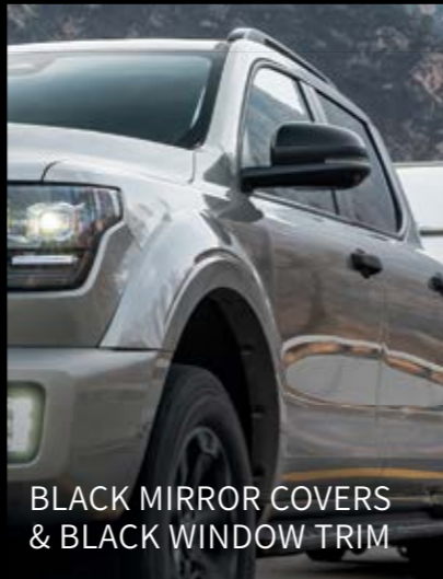
BLACK MIRROR COVERS & BLACK WINDOW TRIM