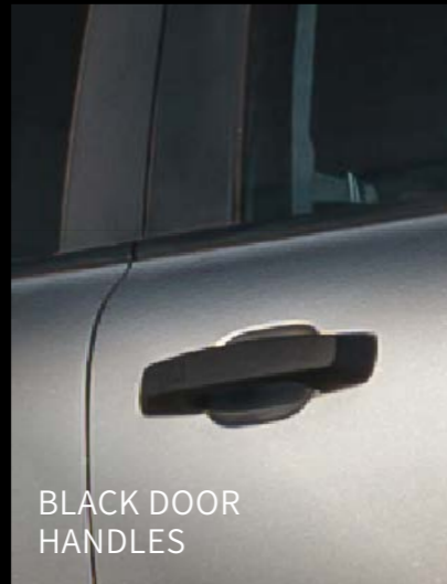
BLACK DOOR HANDLES