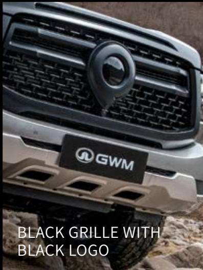
BLACK GRILLE WITH BLACK LOGO